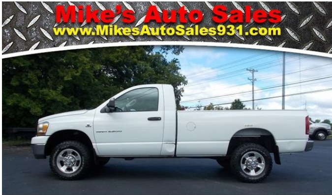
5.9 CUMMINS, 4X4, RUNS GOOD BUT BEEN USED!!

View this car on our website at mikesautosales931.us/7326530/ebrochure