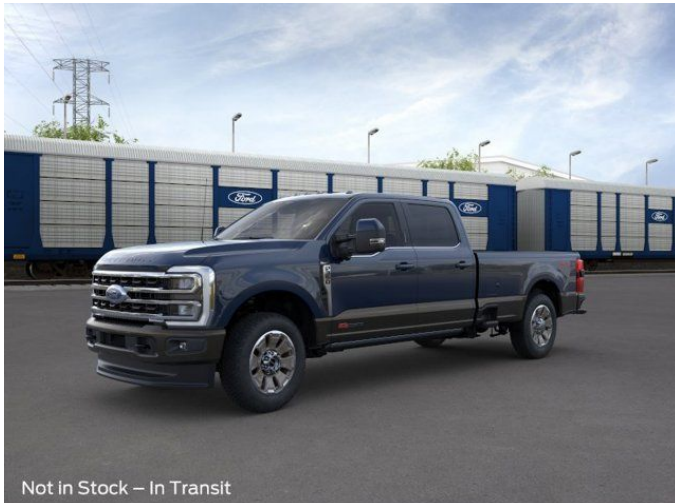
Not in Stock – In Transit

View this car on our website at askjorgelopez.com/7310418/ebrochure