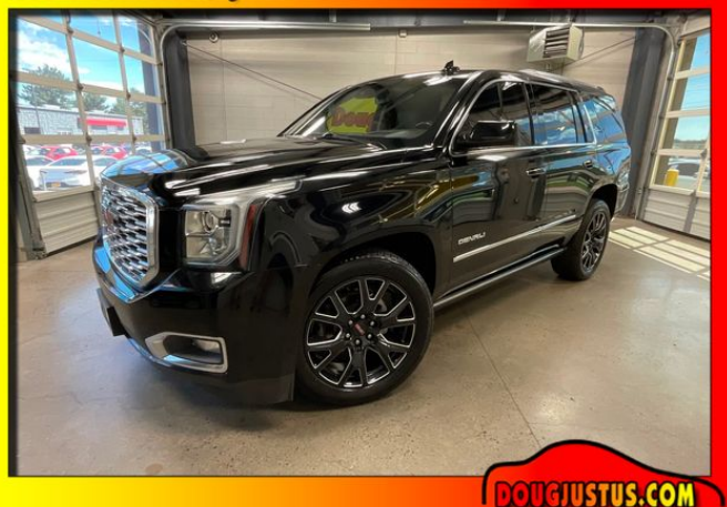
200 + VEHICLES $9,995 OR LESS

View this car on our website at dougjustus.com/7297227/ebrochure