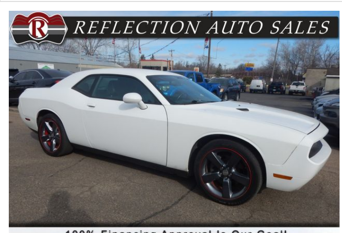
100% Financing Approval Is Our Goal!

View this car on our website at reflectionautosales.com/7294843/ebrochure