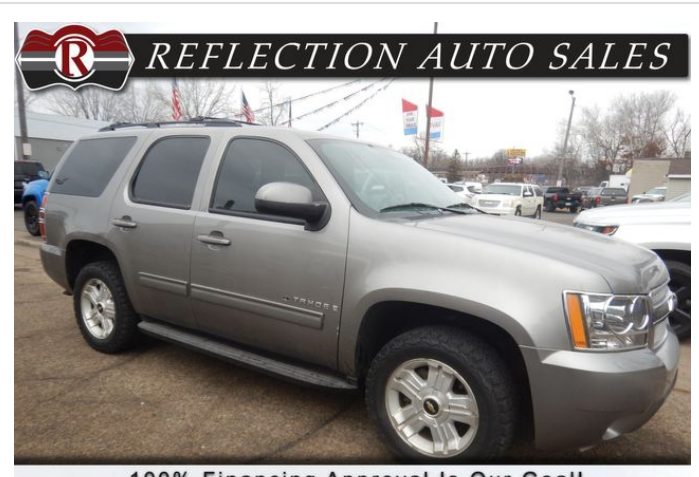
100% Financing Approval Is Our Goal!

View this car on our website at reflectionautosales.com/7283184/ebrochure