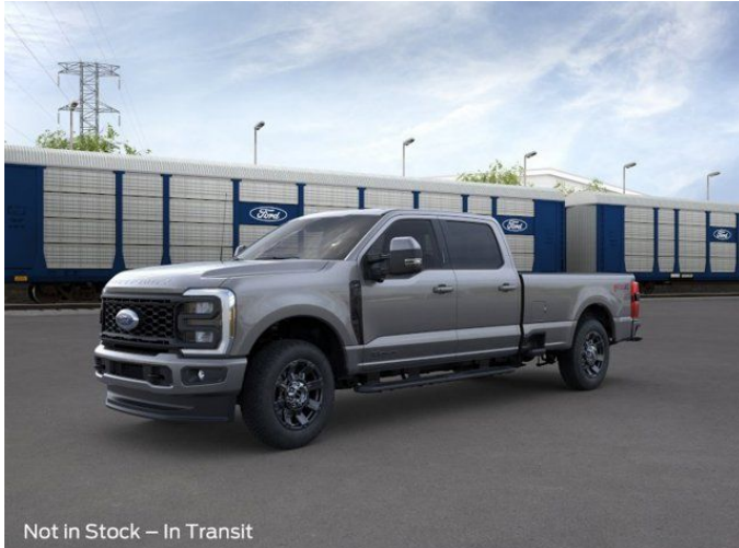
Not in Stock – In Transit

View this car on our website at askjorgelopez.com/7281920/ebrochure