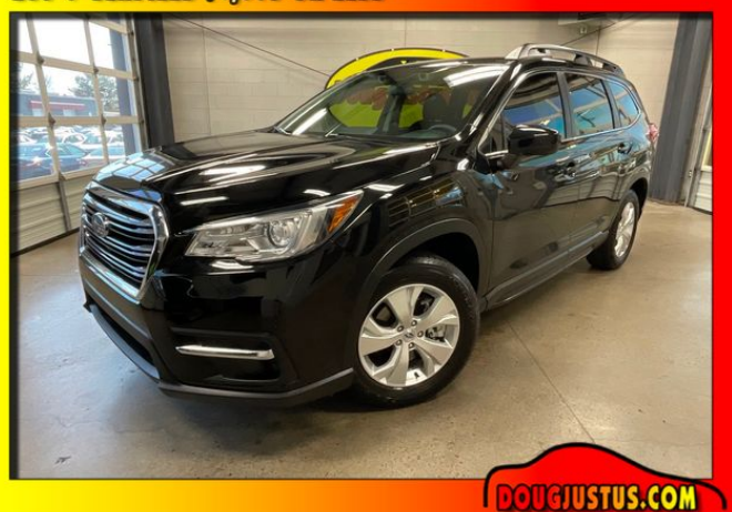
200 + VEHICLES $9,995 OR LESS

View this car on our website at dougjustus.com/7281150/ebrochure