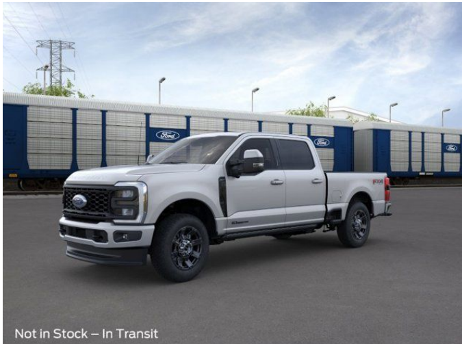
Not in Stock – In Transit

View this car on our website at askjorgelopez.com/7279537/ebrochure