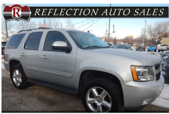
100% Financing Approval Is Our Goal!

View this car on our website at reflectionautosales.com/7277561/ebrochure