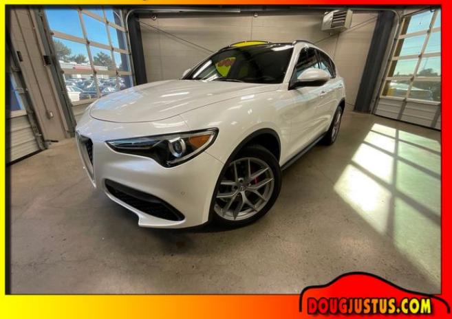
200 + VEHICLES $9,995 OR LESS

View this car on our website at dougjustus.com/7226156/ebrochure