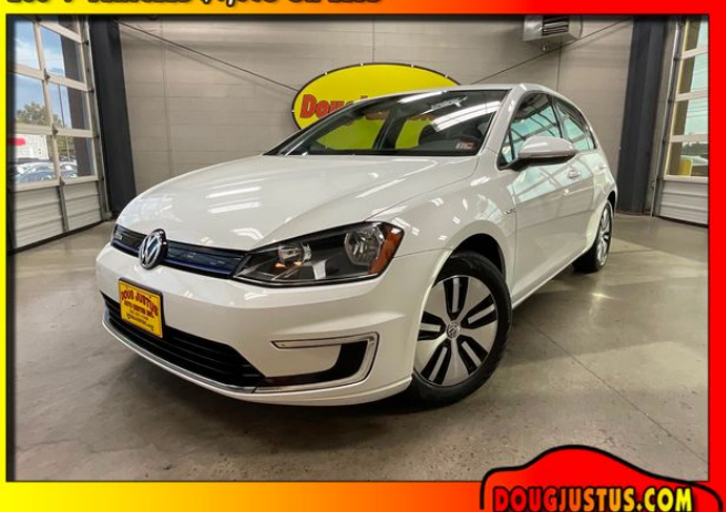
200 + VEHICLES $9,995 OR LESS

View this car on our website at dougjustus.com/7201045/ebrochure