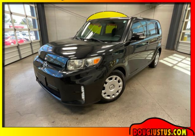
200 + VEHICLES $9,995 OR LESS

View this car on our website at dougjustus.com/7190224/ebrochure