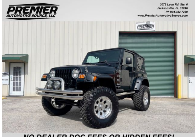
NO DEALER DOC FEES OR HIDDEN FEES!

View this car on our website at premierautomotivesource.com/7186929/ebrochure