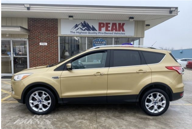
2014 Ford Escape Titanium

View this car on our website at peak-autosales.com/7155842/ebrochure