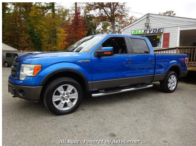
All Ryde - Powered by AutoCorner

View this car on our website at allrydeauto.com/7155576/ebrochure