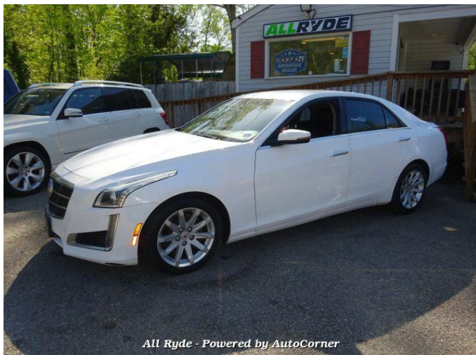
All Ryde - Powered by AutoCorner

View this car on our website at allrydeauto.com/7155555/ebrochure