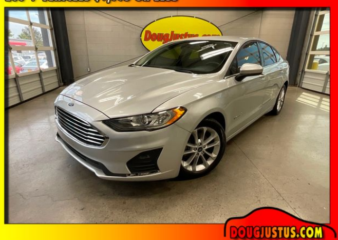
200 + VEHICLES $9,995 OR LESS

View this car on our website at dougjustus.com/7128679/ebrochure