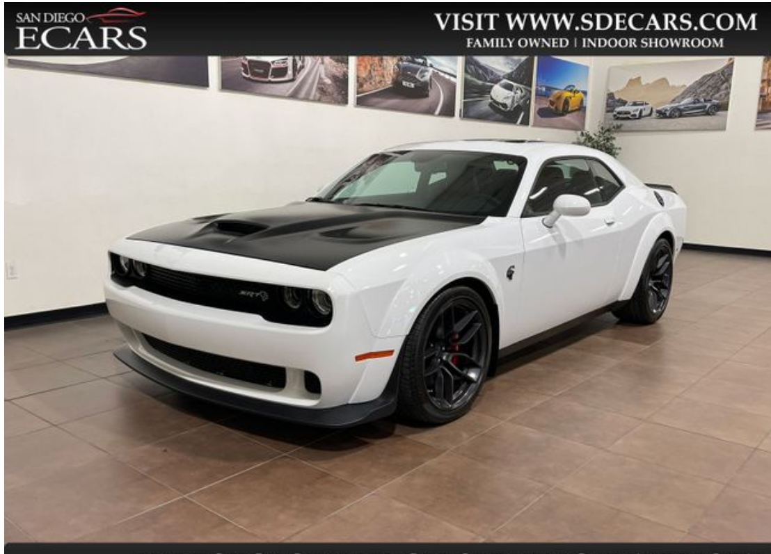
2018 DODGE CHALLENGER SRT HELLCAT WIDEBODY