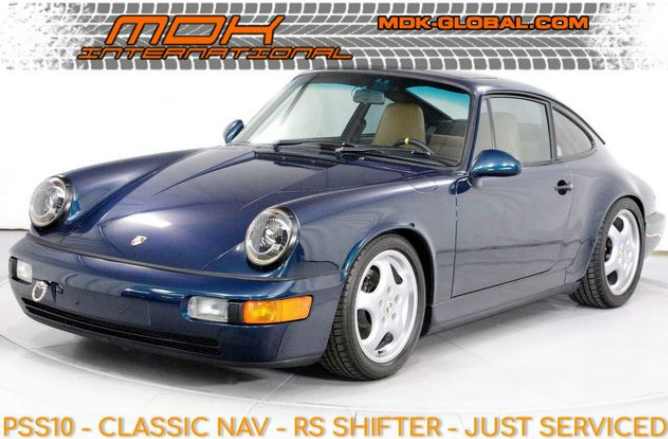
PSS10 - CLASSIC NAV - RS SHIFTER - JUST SERVICED

View this car on our website at mdk-global.com/6845898/ebrochure